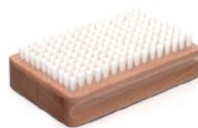
BRUSH NYLON HARD Product No 70090002