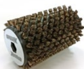
ROTO BRUSH HORSE HAIR Product No 70090011