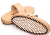
BRUSH NYLON HARD OVAL Product No 70090015