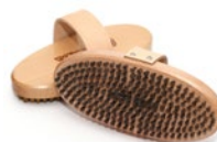
BRUSH HORSE HAIR OVAL Product No 70090016