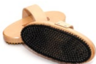
BRUSH BRASS OVAL Product No 70090017