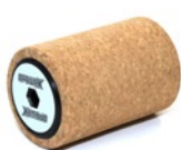
ROTO CORK Product No 70090014