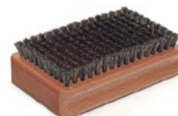
BRUSH HORSE HAIR Product No 70090003