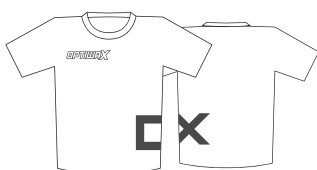
OPTIWAX T-SHIRT WHITE Product No 8300001