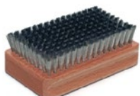
BRUSH FINE STEEL Product No 70090005