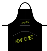
WAX APRON Product No 80090008