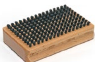
BRUSH BRASS Product No 70090004