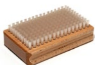
BRUSH NYLON/ CORK Product No 70090021