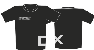
OPTIWAX T-SHIRT BLACK Product No 8310001